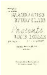
Mr. Louis Lomax Lecture (082-006-029_001)