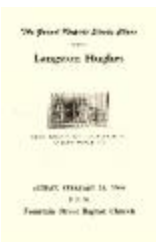
Langston Hughes Lecture (082-006-021_001)