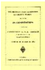
The Michigan State Association of Colored Women Convention Program (082-006-017_001)