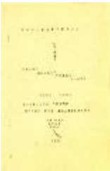
Constitution of the Grand Rapids Study Club (082-006-005_001)