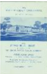
Ottawa Hills Library brochure (109-061-012)