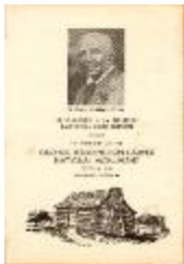
Dedication of the George Washington Carver National Monument (082-006-015_001)