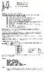
Study Club Gazette Newsletter - I (082-006-043_001)