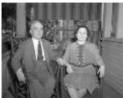
Agen Cafe, Greek Consulate (125-h000112_003)