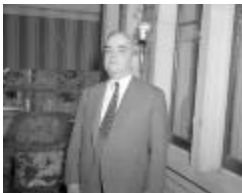
Agen Cafe, Greek Consulate (125-h000112_001)