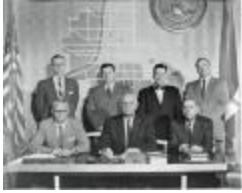
Grand Rapids City Commission / City Officials (54-10-22)