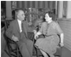
Agen Cafe, Greek Consulate (125-h000112_002)