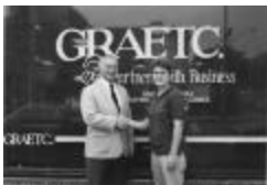
Grand Rapids Area Educational Technology Council (388-013-021_479)