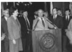
CCC Announcement (388-013-010_485)