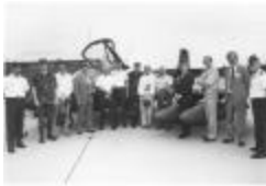
Visit to Camp Grayling (388-013-019_477)