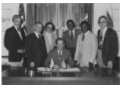
House Bill 4538 (388-013-005_481)