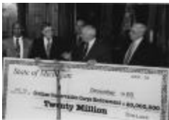
Presentation of check to Civilian Conservation Corps Endowment (388-012-013_437)