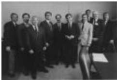
Presidential Candidate Michael Dukakis visits GVSU Eberhard Center (388-012-012_436)