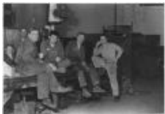
Leitelt Iron Works, mid-1960s (388-014-016_474)