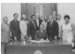
Signing Legislation with Governor William Milliken (388-012-019_440)