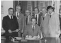
Mathieu-Gast Home Improvement Act of 1978 (388-013-003_442)