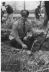
Michigan CCC Kick Off (388-013-014_487)