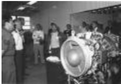
Visit to Camp Grayling (388-013-019_478)