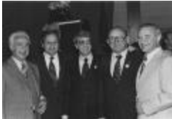
"5th Annual 39th" Birthday Party (388-012-010_434)