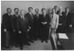
Presidential Candidate Michael Dukakis visits GVSU Eberhard Center (388-012-012_436)