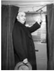
Arthur Vandenberg (125-h017933_002)