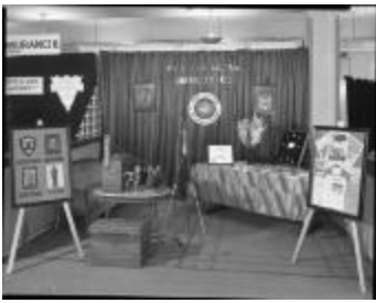
Safety Display (125-o1135_001)